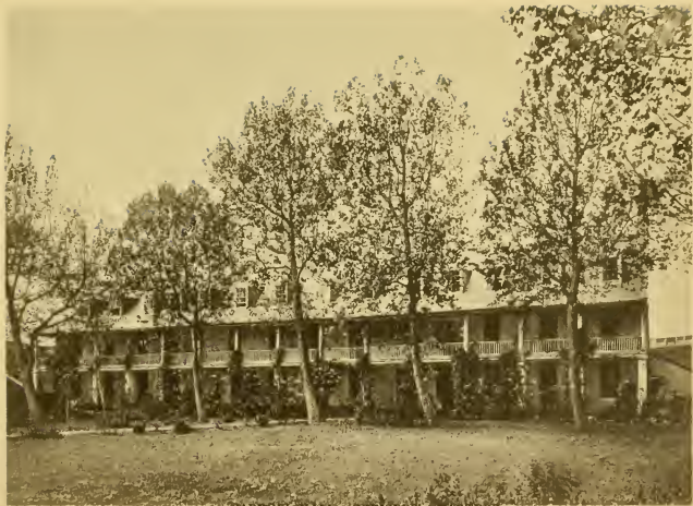
CARROLL HALL — OFFICERS' QUARTERS.